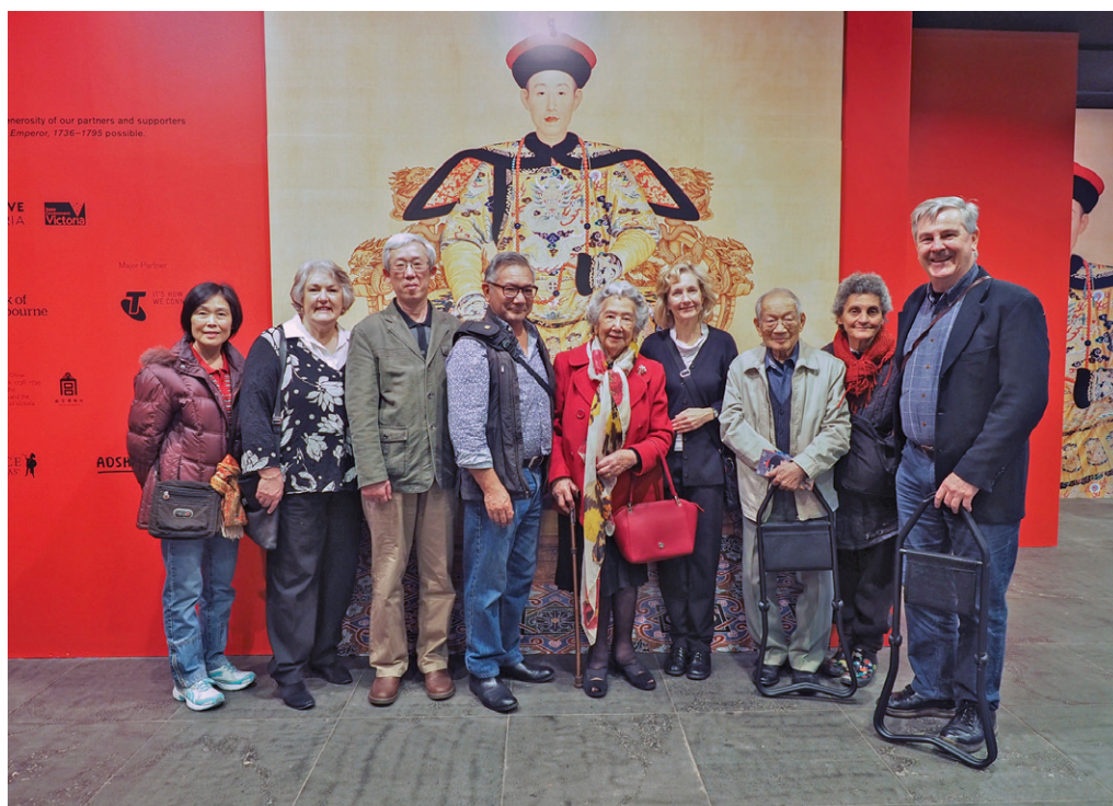
ACFS members waiting at the front of the Golden Age exhibition