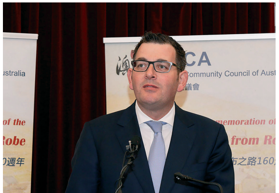
Victorian Premier Hon Daniel Andrews apologises to Chinese community for racist policies during gold rush era

Twenty days later at the end of the re-enactment, the walkers were welcomed to Parliament House by the Premier Hon Daniel Andrews MP who expressed