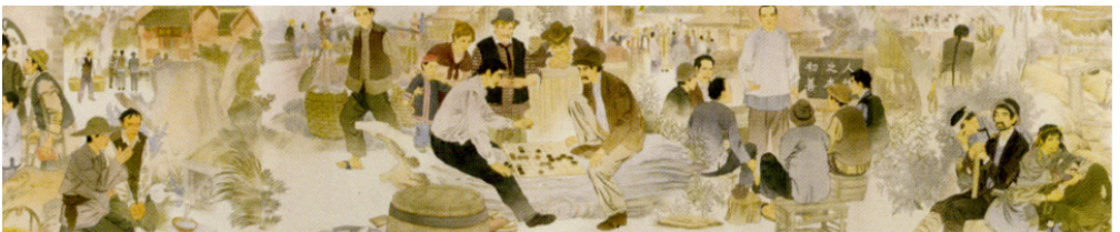
Image: Harvest of Endurance.