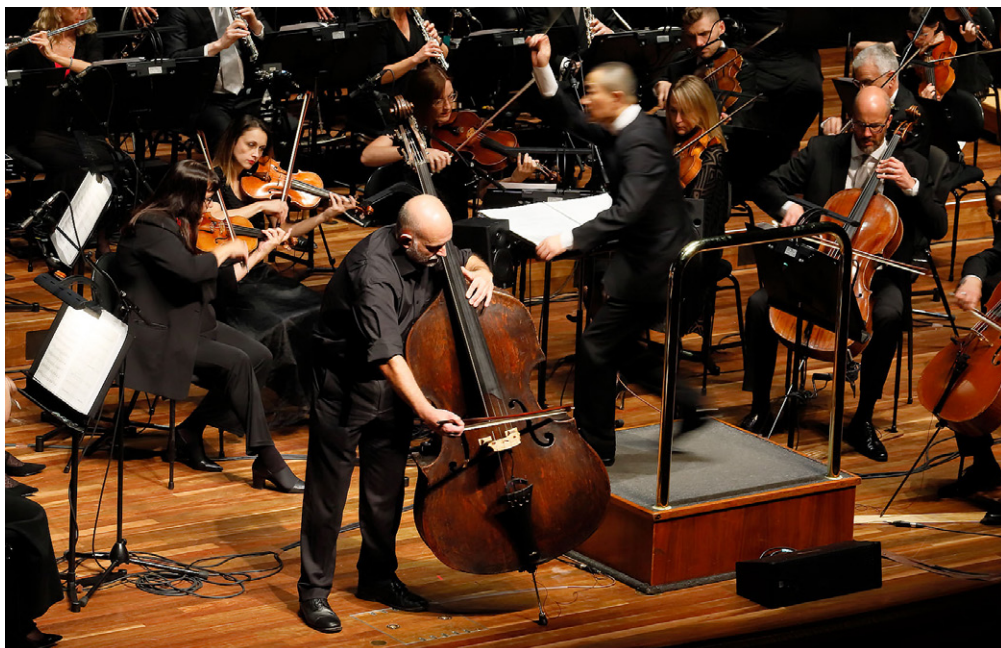
Maestro Tan Dun's Contrabass Concerto: "Wolf Totem"

The combination of Symphony and rock was amazingly smooth under Tan Dun's baton and a good time was had by all with the audience being asked to participate with a special App of bird sounds in one instance. The Concert Hall "rocked" clapping, feet stamping and plenty of vocalization from the audience. My favourite piece was Tan Dun's own composition "Contrabass Concerto: Wolf Totem". Not only was the music evocative but the visuals of wolves in their natural habitat in the snow of Inner Mongolia with their calls imitated by the instruments was truly remarkable. A very memorable concert indeed which shall no doubt be remembered with nostalgia.