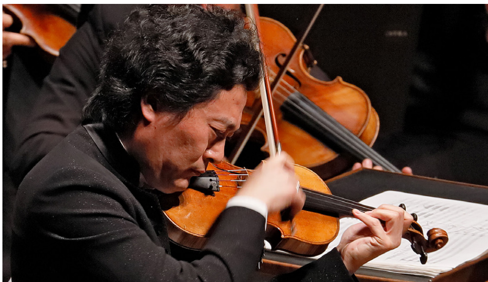
Violinist Lu Siqing

In case you missed out on these there's plenty more coming up soon violinist Lu Siqing joining the MSO for two concerts on March 15 th and 16 th at Hamer Hall.