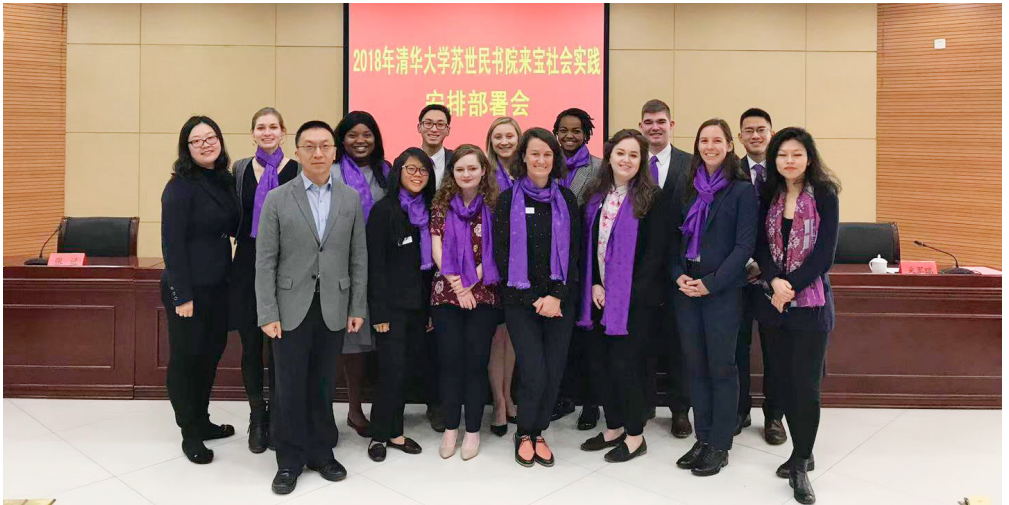
The class mates and professors from the 'social reforms and changes' subject

We have finished our first two modules of study, in which I took subjects such as 'Social changes and reforms in China', Chinese Language studies, 'Comparative Governance', 'Chinese History Culture and Values' as well as 'Leadership in versatile environments' plus more.